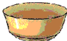
bowl and spoon