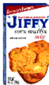
Jiffy corn bread mix