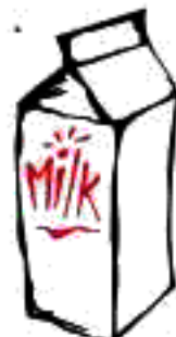
1/3 cup milk